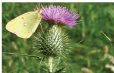
Milk Thistle Extract (80% UV or 50% HPLC)