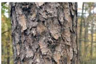
Pink Bark Extract (95% OPC)