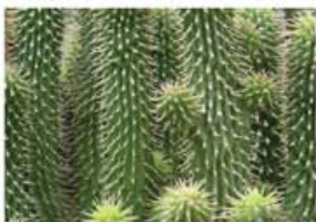
Hoodia extract 20:1 (African genuine species)