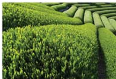
Green Tea Extract