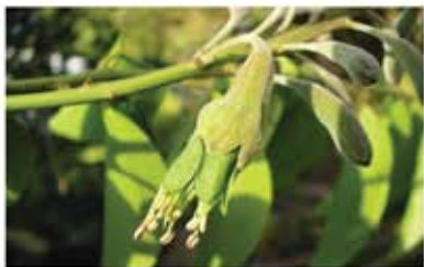
5-HTP (Griffonia simplicifolia seed extract), (98% & 99%)