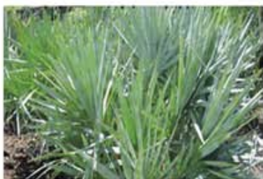
Saw Palmetto Berry extract (25%, 45% Fatty Acids)