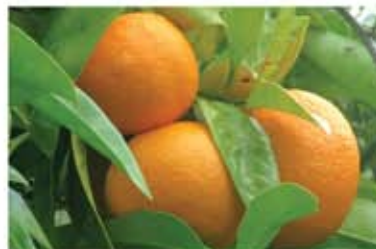
Hesperidin (Citrus Aurantium Extract)