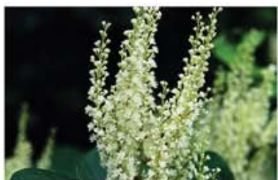
Polygonum Cuspidatum Extract (50% or 98% Resveratrol HPLC)