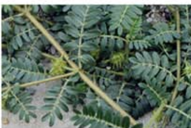
Tribulus Terrestris Extract (40% Saponins or Protodioscin)