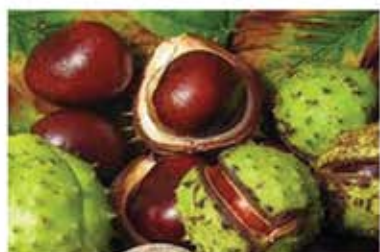
Horse Chestnut Extract