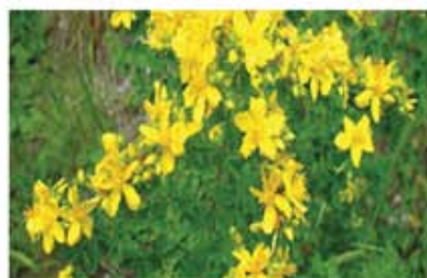
St. John's wort Extract (0.3% UV Hypercins UV)