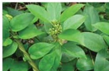
Gymnema Sylvestre Extract