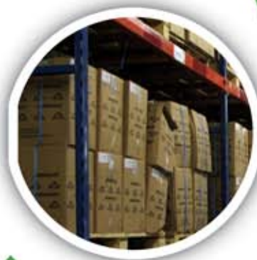
Stock In USA