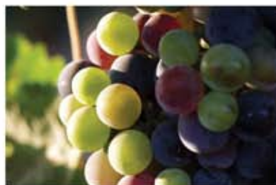
Grape Seed Extract