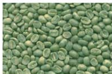
Green Coffee Extract