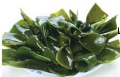
Laminaria Japonica extract

(15%-95% Fucoidan or 1%-30% Fucoxanthin)