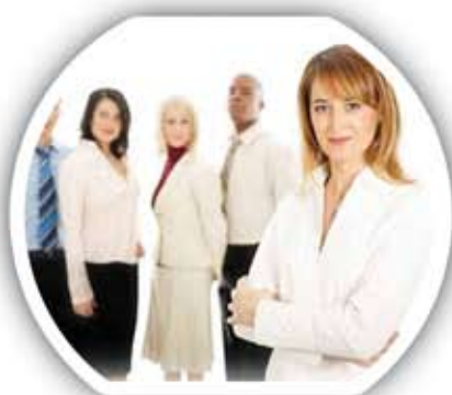
Sales & Marketing