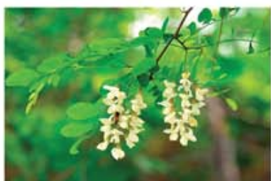
Rutin & Quercetin Dihydrate