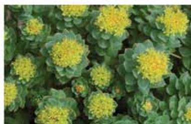
Rhodiola Rosea Extract (3% rosavins or 1% salidroside)