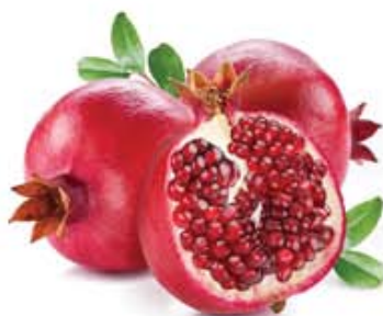
Pomegranate Extract (40% Ellagic Acid, 40% Punicalagin)