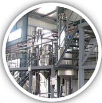
Production & QC