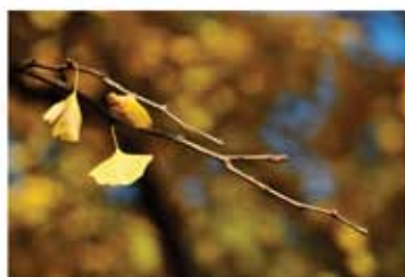
Ginkgo Biloba Extract